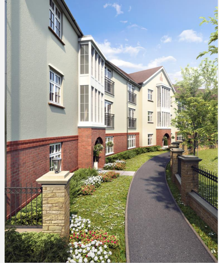
Ebbsfleet Green, Kent